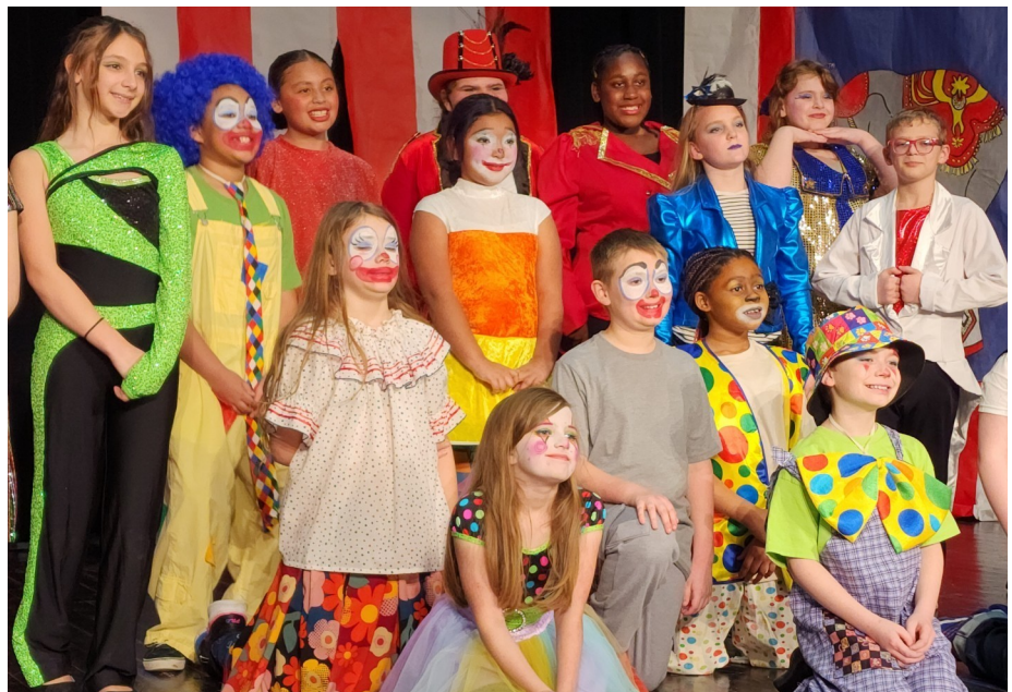
Cast of Trice Circus Extravaganza