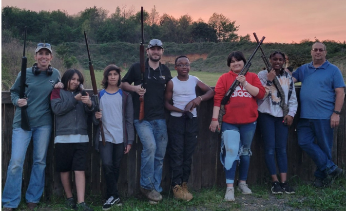
Home on the Range!