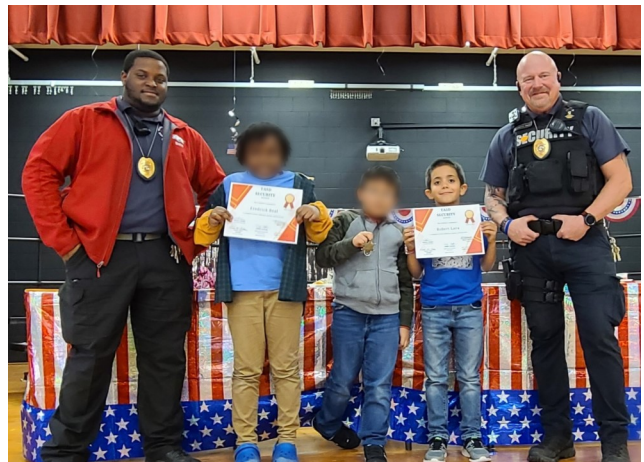
Super Student Award Winner!

***To give credit for the original ideas from others, this article was written after gleaning thoughts from Louie Giglio and Christine Caine.