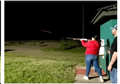
Ready. Aim. Fire!!