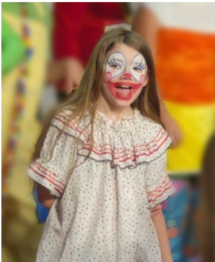
Two of our Fine Art Kiddos