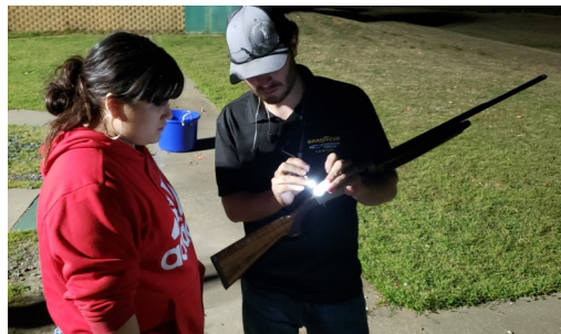
Learning the components of a shotgun shell.