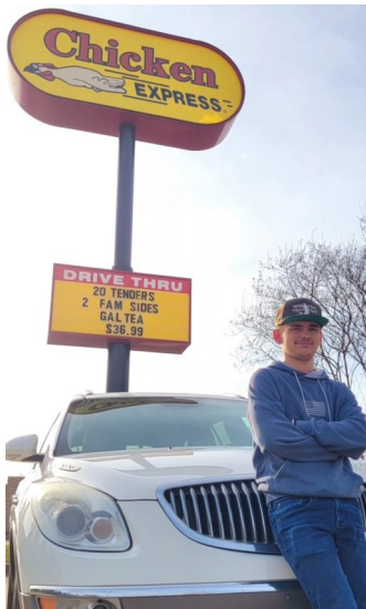
First Day of Work