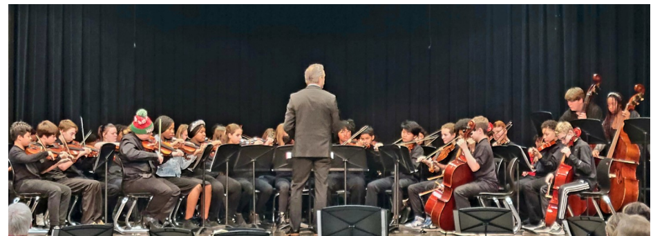
Arkansas Middle School Christmas String Concert